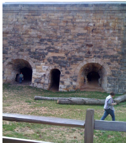
Figure 3. Photo of Fitchburg Iron Furnace.

Well, the weather was great and I decided just to go. I am pleased to report that I learned a lot, enjoyed myself, and I am glad I went. We visited three furnaces, Estill,