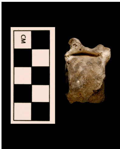
Figure 5. View of left deer astragalus recovered from Feature 1 at the Flat Run Site (15HR54) with unidentified markings shown on the ventral articular surface.

The Artifact of Interest this issue is a left deer astragalus (Figure 5) recovered from Feature 1 at the Flat Run Site (15HR54). The astragalus is a bone that occurs in the back legs of deer articulating with the calcaneum and other tarsal bones between the tibia and metatarsal bones. The specimen is burned calcined with yet unidentified marks on the ventral articular